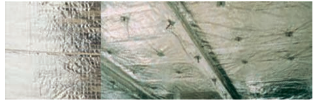
Reinforced aluminium foil

Note: The aluminium foil on wired mats will be perforated by the stitching process and cannot be used as vapour barrier.